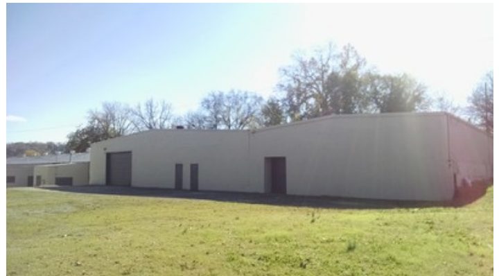
1700 Anderson Ave Front View