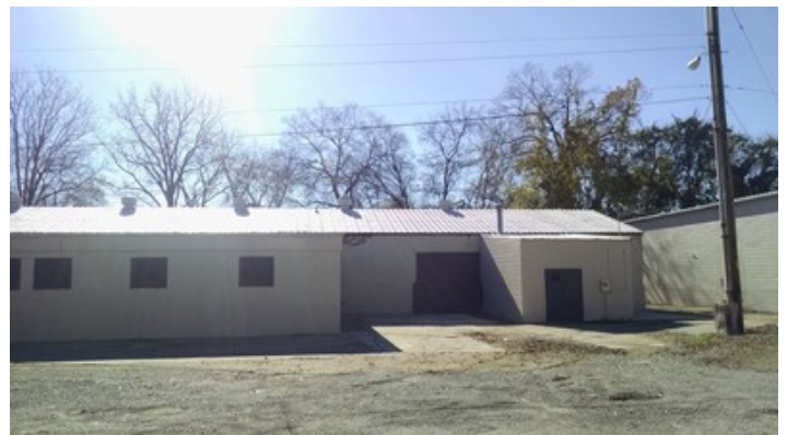
1700 Anderson Avenue Front View2